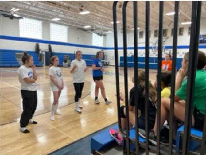
High School Volleyball captains and leaders share their experiences with our NMS 7th grade volleyball team.

What an amazing start to our 2023-2024 school-year! We are really proud of what our students are accomplishing and the positive atmosphere at the Middle School. I can’t wait to see what our students will accomplish by the end of May this year! In the meantime, I want to take this opportunity to celebrate some of the success we have experienced at the Middle School so far (and maybe brag just a little bit).