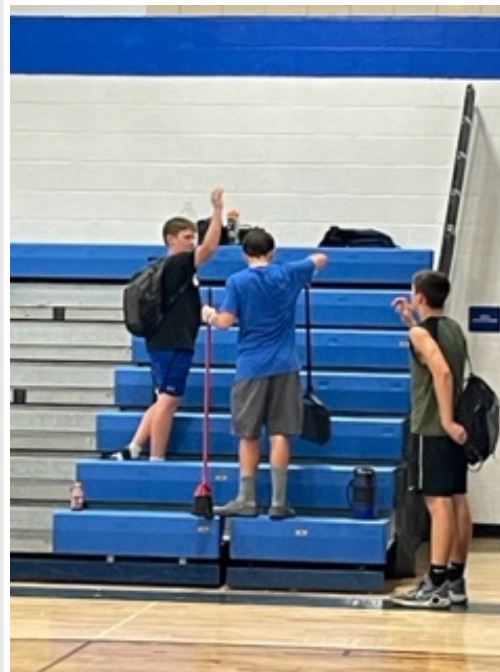
Student helpers at the Middle School, cleaning up after a volleyball game.