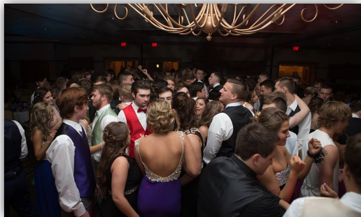
Students really had a magical night at our "Magic Carpet Ride" prom on May 6!

Intensely competitive advertising is seen as necessary to attract new students, but to what extent does its effectiveness reach if it is just ignored and thrown away?