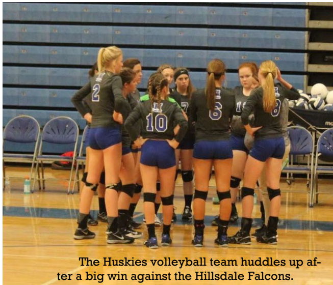
The Huskies volleyball team huddles up after a big win against the Hillsdale Falcons.

As football season comes to a close and our senior football cheerleaders say goodbye to the sport they all know and love, basketball cheer is starting up soon. Come see the 2017-2018 Varsity and Junior Varsity cheer squads in the season opener against Triway High School on December 1st.