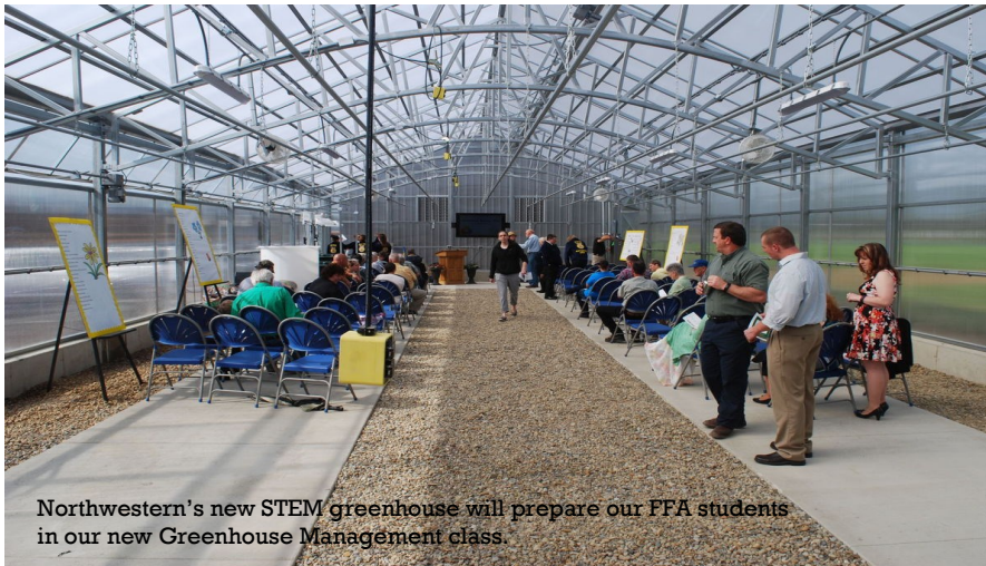
Northwestern's new STEM greenhouse will prepare our FFA students in our new Greenhouse Management class.

In 2016 the Northwestern Agricultural department installed a turbine-powered greenhouse. The new building will be used to grow plants and house fish to use their feces as fertilizer. The greenhouse management class has spent most of the first nine weeks assembling tables and building an aquaponics system. The tables will be used to dissect and manage the plants' growth and health.